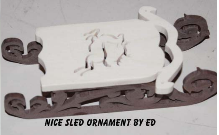
NICE SLED ORNAMENT BY ED