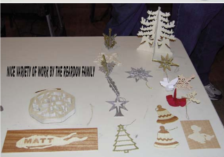
NICE VARIETY OF WORK BY THE REARDON FAMILY