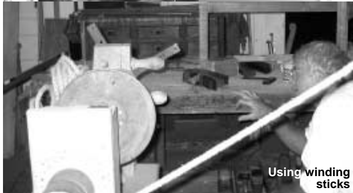
Using winding sticks