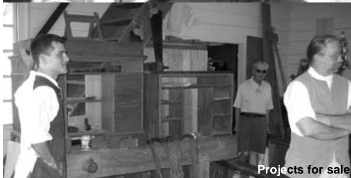
Projects for sale

The hand planes were all wooden of course. Many members know my affinity for wooden planes, so I was on familiar turf here. More familiar than normal. As I reported several months ago, the planes used in Colonial Williamsburg are made by Clark and Williams, and are available today. They are the best wooden planes in the world, and after seeing them in action, I intend to get one of those gems.