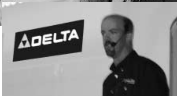
DELTA visits the Club.

In this issue... A new novel about Daum, Mike Daum, Intrepid Secret Agent,