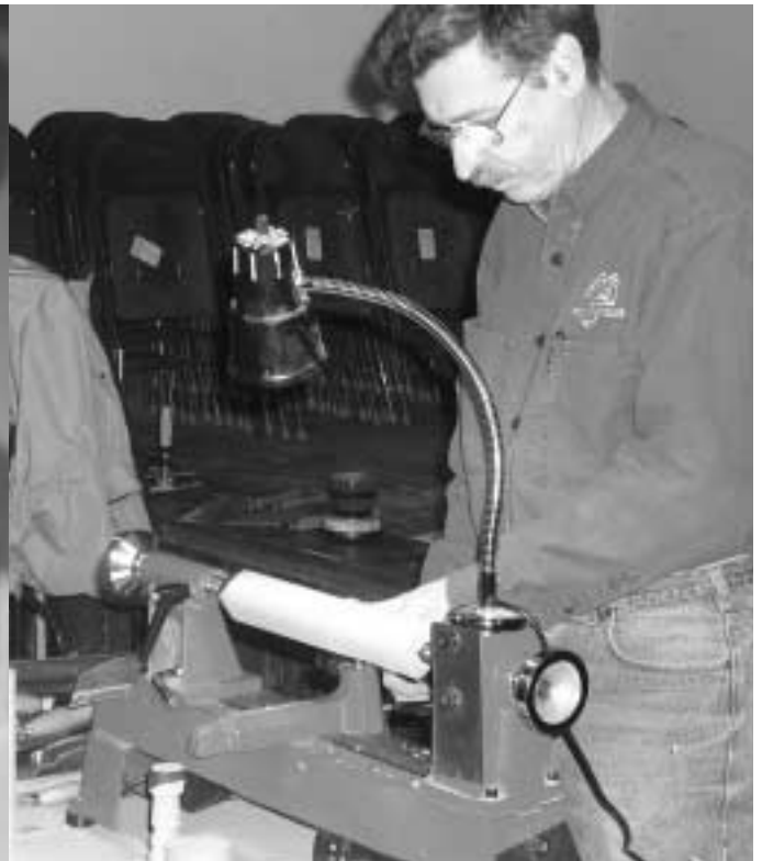
Photos from the February Turner's Guild Meeting