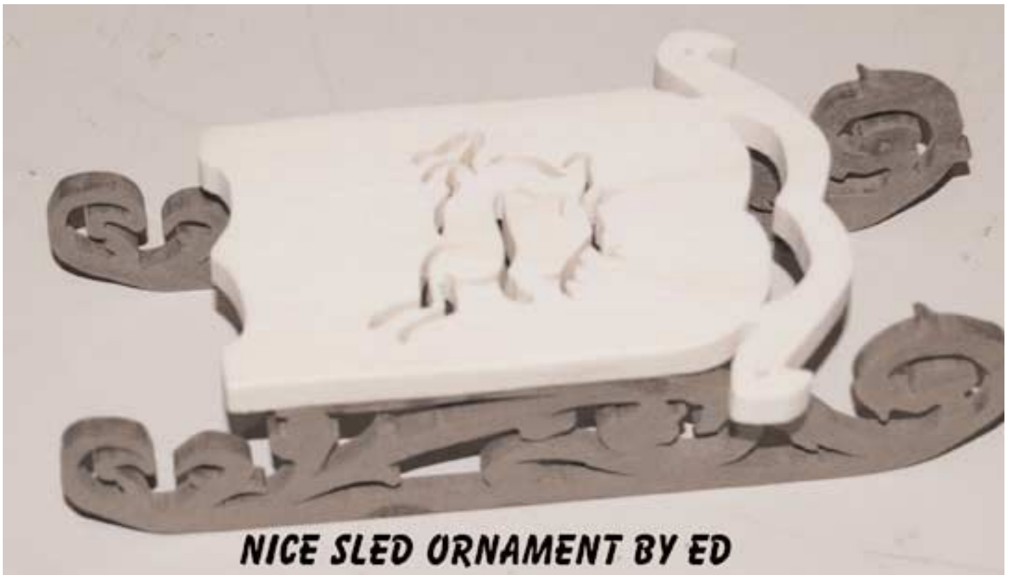
NICE SLED ORNAMENT BY ED