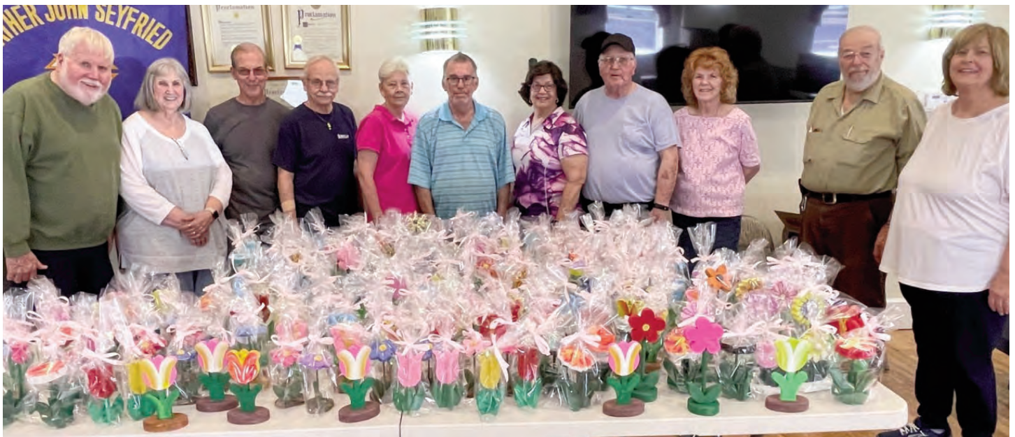
227 flowers ready for donating

The SIG members and the Toy Committee made 227 flowers to donate to nursing homes for Mother's Day. We finished painting and bagging them at the April SIG meeting. We would like to thank everyone who contributed to this effort! Your work will bring smiles to many residents. There should be pictures of some happy faces for the June edition of the Woodrack.