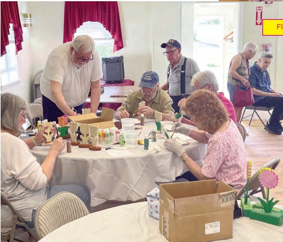
Flower painting & bagging.