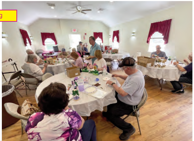
Great turnout for our flower painting